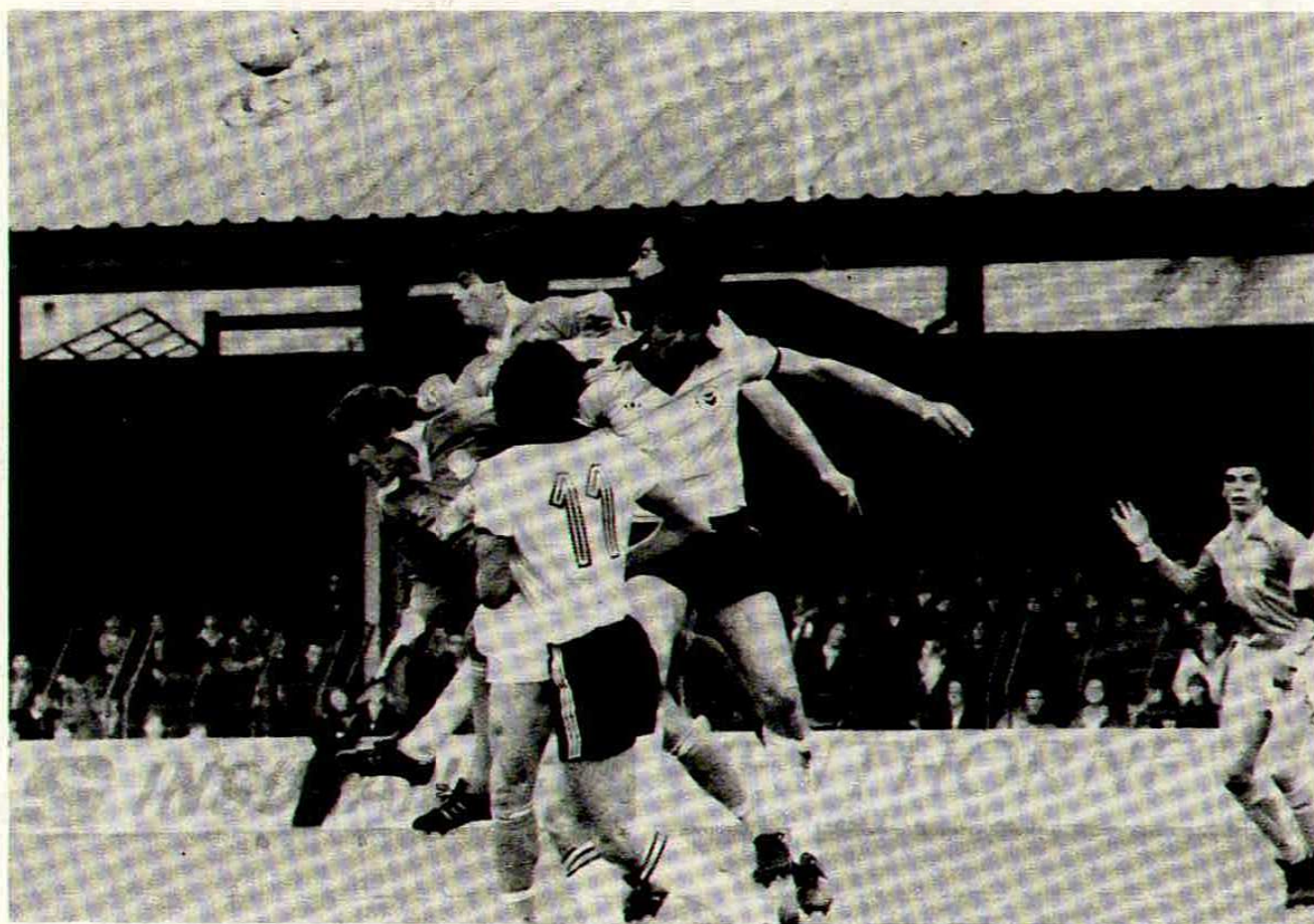
Newport defenders beat off McEwan and Ashurst