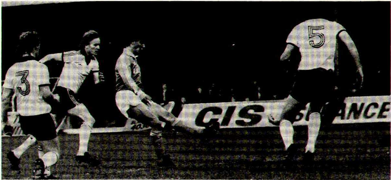
Gary Williams tries a shot

BLACKPOOL 2, NEWPORT 4 Phil Heywood captures the action